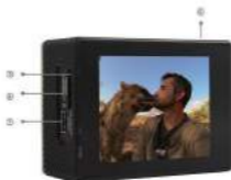
5.TF card slot 6.USB slot 7.HDMI 8.OK