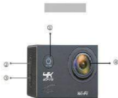
1.Power/Mode 2.UP/WI-FI 3.DOWN 4.LENS